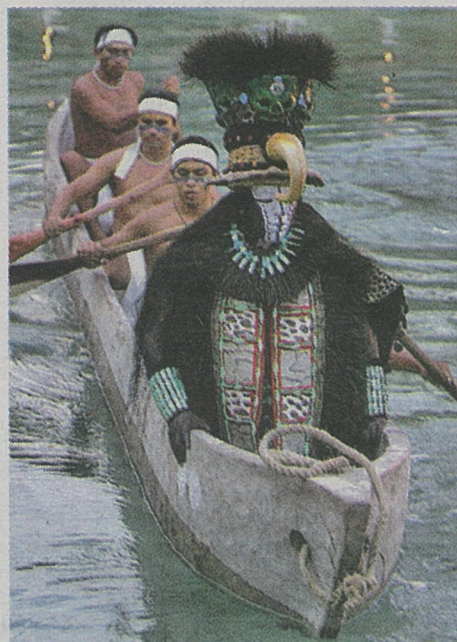
A Mayan priest leads a pilgrimage in honor of the Mayan goddess Ixchel.

Surfers bask in the beating sun, parasail silhouettes litter the horizon; Jet Skis skim the waves, and yachts gracefully undulate on the water. Playa, Spanish for "beach,"