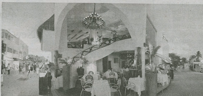
In Playa, exquisite silver, handcrafted textiles and more are for sale; at left, La Casa Del Agua offers memorable dining.

papadzules, traditional Mayan tortilla-based snacks. An appetizer, entree and two very powerful margaritas cost less than $40 — and it felt like a steal.