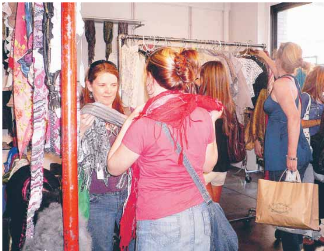
Shop Gotham Walks lead tour guests to deals they might not be able to find otherwise.