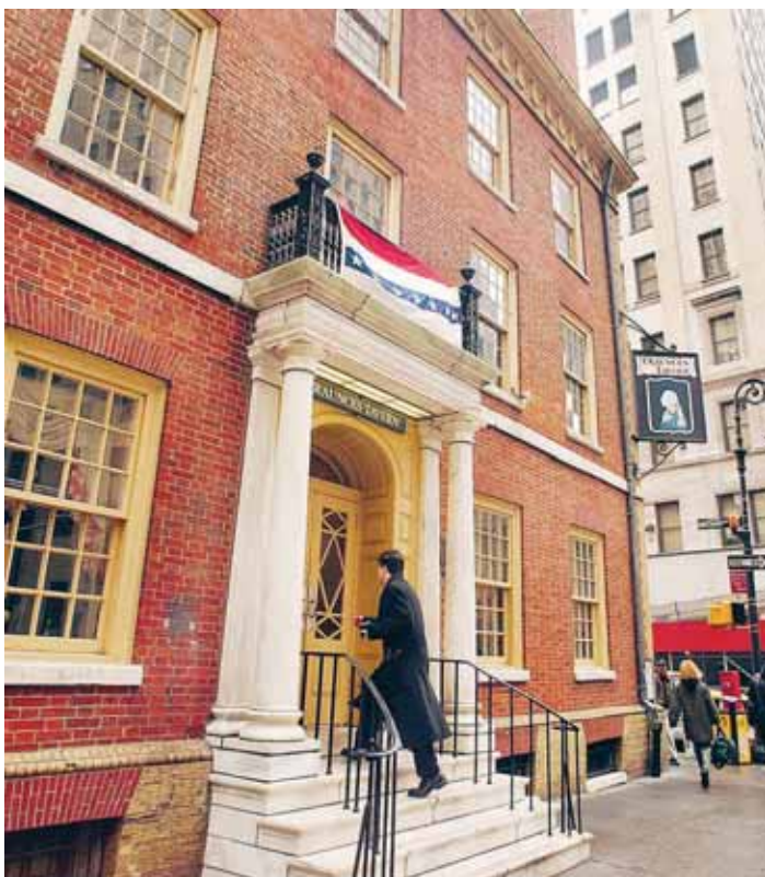
Have a tea party at historic Fraunces Tavern on the Patriot Tour of Lower Manhattan.