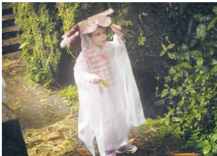
A leaf works well as an umbrella in El Yunque rain forest.

natural beauty of the region, the resort occupies two miles of private beach and has the Caribbean's first certified Gold Audubon bird sanctuary. A hydroponic garden produces fruits, vegetables, herbs and spices used in treatments at the massive spa and in the kitchen of Fern, its Jean-Georges Vongerichten restaurant. Plantation-style buildings house luxury accommodations, and guests are encouraged to explore with nature walks, bird-watching and kayaking tours. An oceanfront Robert Trent Jones Jr. golf course rounds out the amenities ( stregisbahia.beach.com ; rates from $579).