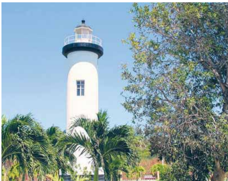
PUERTA DEL SOL PHOTO