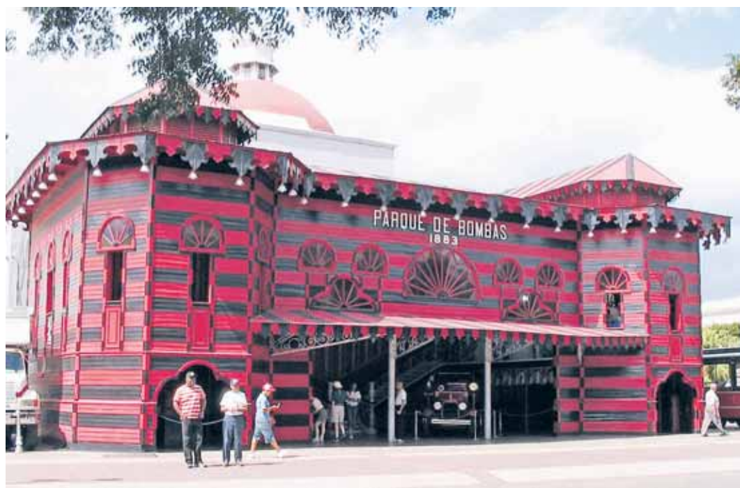
Parque de Bombas, on Ponce's main square, doubles as a fire museum and a visitor's center.

The big news coming out of Rio Grande, the territory due east of San Juan, centers on the new St. Regis Bahia Beach Resort , which opened last November. Emphasizing the