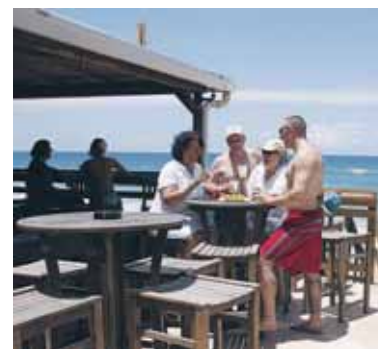
Tambo is a beachfront watering hole in Rincón, famous for nightlife.

Don't surf? There's plenty of swimming beaches like Balneario, Corcega and Los Almendros, and the Punta Higuera Lighthouse is a perfect locale for spotting whales (the season runs December through March). For aquatic adventurers,