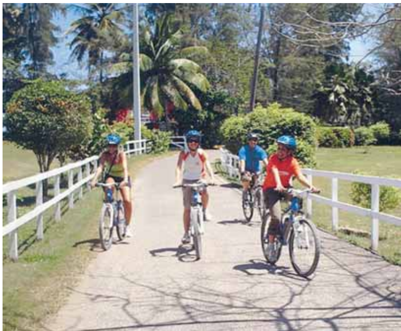
PUERTA DEL SOL PHOTO